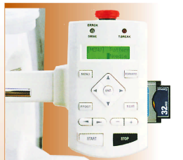
Send designs by USB, LAN serial cable, or FLASH card