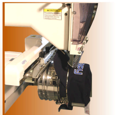
Sews on finished caps (with optional kit)