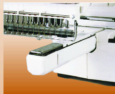
Narrow cylinder arm allows great versatility in sewing!