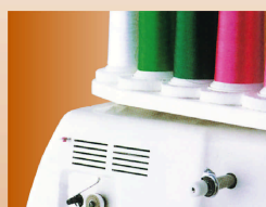
Built-in bobbin winder